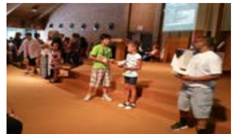
Holy Communion at Mission u

14 kids from St. Paul heading to Camp Wesley!