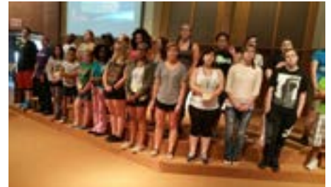
Youth at Mission u

The adult Mission u participants studied The Bible and Human Sexuality and Climate Justice; the youth and children studied Climate Justice. Everyone came away with a sense of Christian community and connectedness. We are ready to do more mission education here at St. Paul!