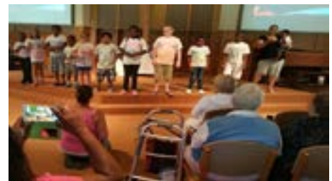
Children at Mission u